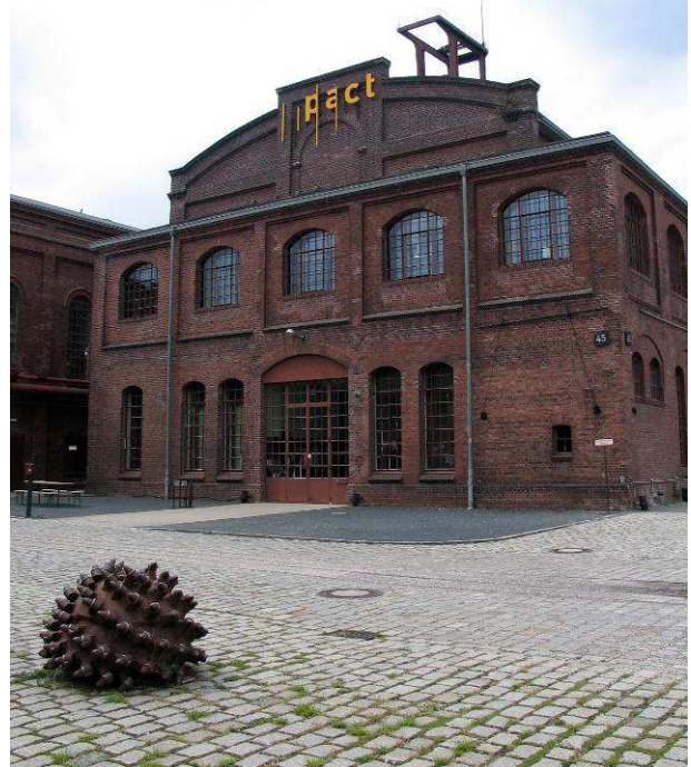
Figure 3: Zollverein industrial complex

This preservation of these sites is only possible because its mines or the industry had out lived their usefulness and were no longer commercially viable. However, many industrial sites remain viable and productive, like Newcastle and many others around the world, and a physical restoration in situ is impossible.