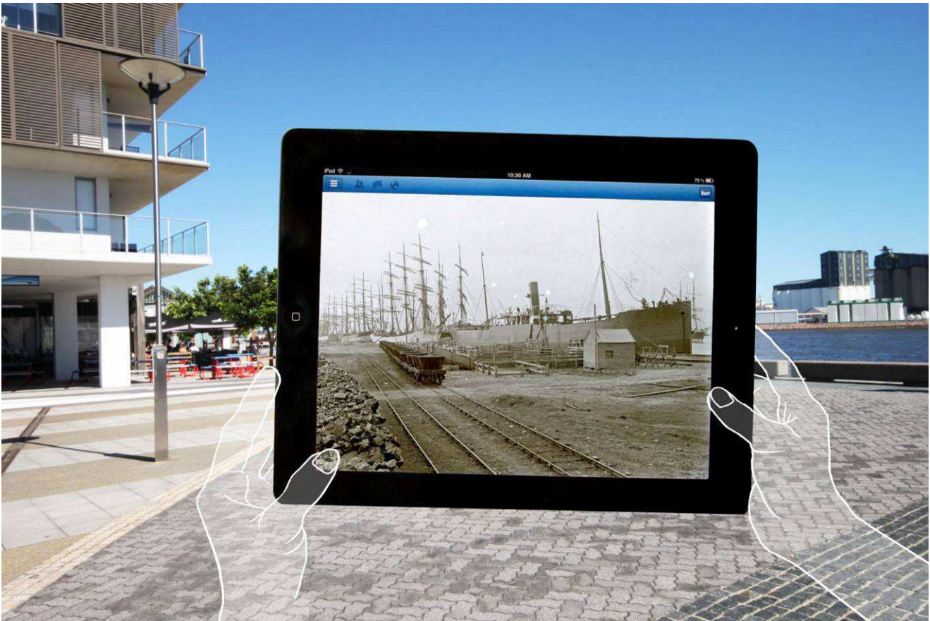
Figure 6: Loading coal 1900, the modern image shows industry on the north side of the harbour while the south side is a harbour promenade lined with cafes and restaurants

The project builds on existing AR and mobile technologies (Portales, 2009), and the concept of the ubiquitous city (Burns, 2006). The concept of the ubiquitous city is to link all urban systems through information technologies and to effectively inform and connect people. Shared data and computers are built into the urban infrastructures such as shops, streets and office buildings and this information is accessed intuitively through mobile and other tangible devices (Gervais & el al, 2007). Users can immediately get information on transport, entertainment, reviews and street directions, which interacts and directs them for further use. South Korea is currently exploring this concept and the supporting technologies in its pioneering cities. For example, they are currently building New Songdo City which will link all information systems to all houses as well as shops, streets and offices. While the technology is currently being trialled for social, entertainment and convenience purposes, this research project refocus and further this approach into a cultural and societal one.