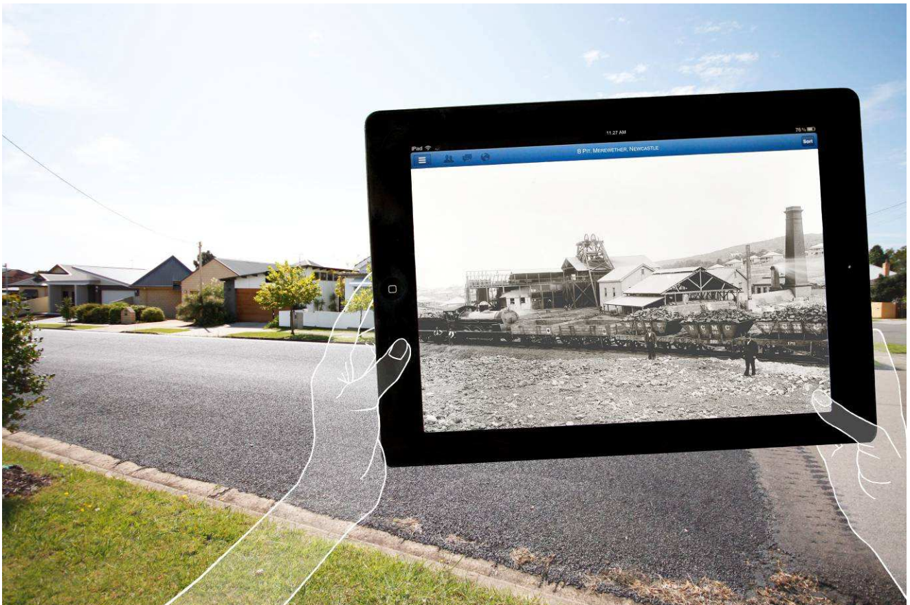
Figure 5: Photoshop mock-up of a coal pit at Merewether, now a suburb of Newcastle with no industry

current technological climate, driven by a thriving social networking movement, makes it possible for both users and researchers to be directly involved in contributing layers of meta-data to a constantly evolving virtual urban topography. Through the lens of the current entry-level smart phone, a user is exposed to an extra dimension of information, which runs in parallel to the physical world. If this extra dimension is applied to applications of preserving the cultural heritage of a place, the historical value and identity can be virtually reborn and conserved for future generations. This is made possible by the continuing advances in augmented reality applications (Morrison & Gu, 2011); this process of exploration in a city is linked with a ubiquitous platform of multimedia content that has the potential to spark a rebirth of an architecture of the past, for the future.