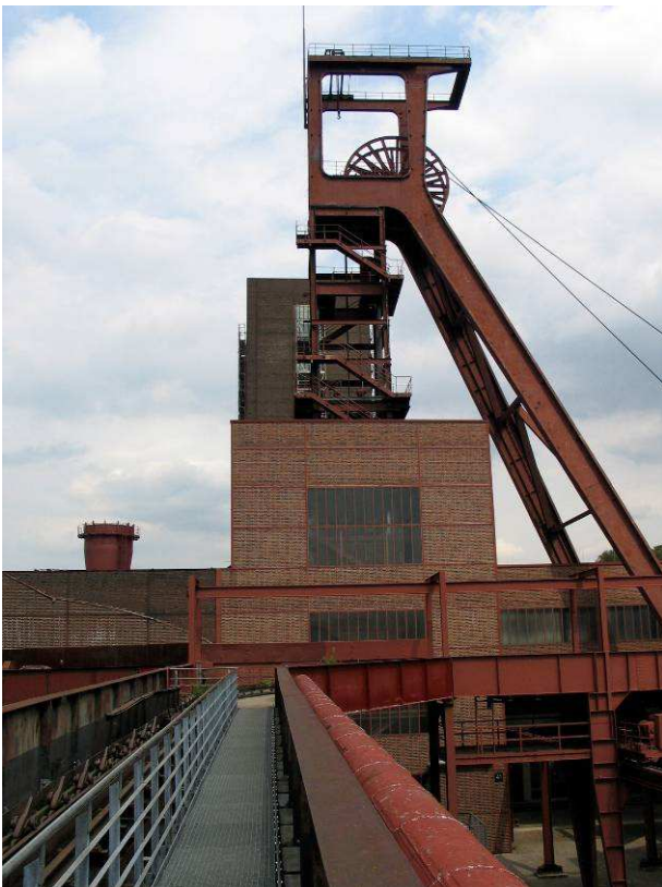
Figure 2: Zollverein industrial complex