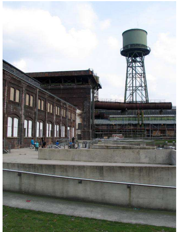
Figure 4: Jahrhunderthalle (Century Hall) at Bochum