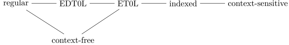
FIGURE 1. Containments of formal language classes. Each edge from left to right represents strict containment.

received particular attention. It is a subclass of indexed languages in the sense of Aho [1], see for example [8]. Indexed languages are context-sensitive, and they strictly contain all context-free languages. The classes of EDTOL and context-free languages are incomparable [8] and therefore the inclusion of EDTOL into indexed languages is proper.