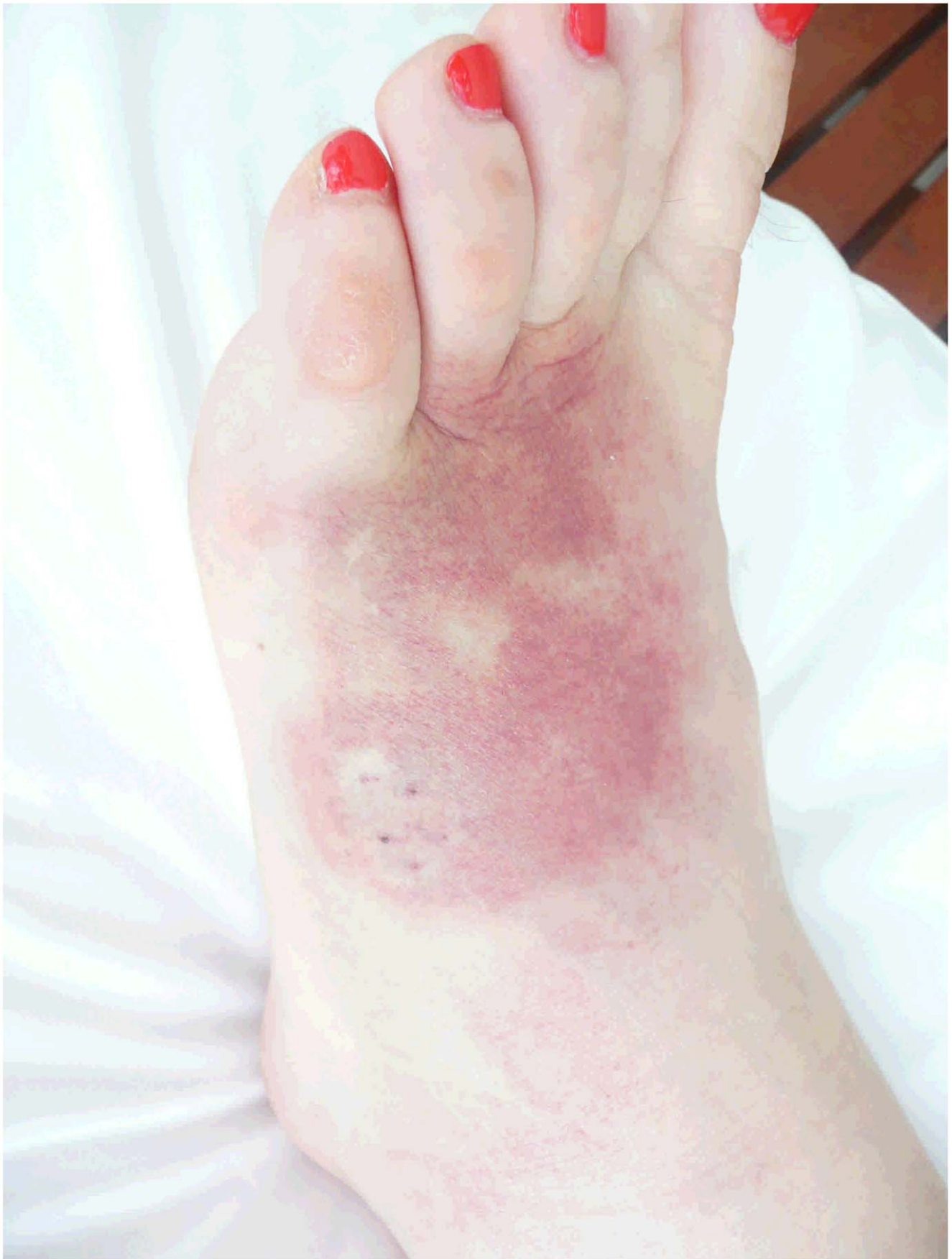
Figure 2. Local effects from a death adder bite to the foot. doi:10.1371/journal.pntd.0001841.g002