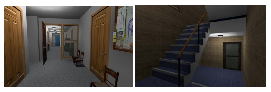
Figure 1 Modified environment presented to construction management cohort

In stage 2, the original environment was presented to participants so that they could navigate around the environment and provide feedback on areas such as realism to the working environments of which they had operational knowledge and experience (refer Figure 2).